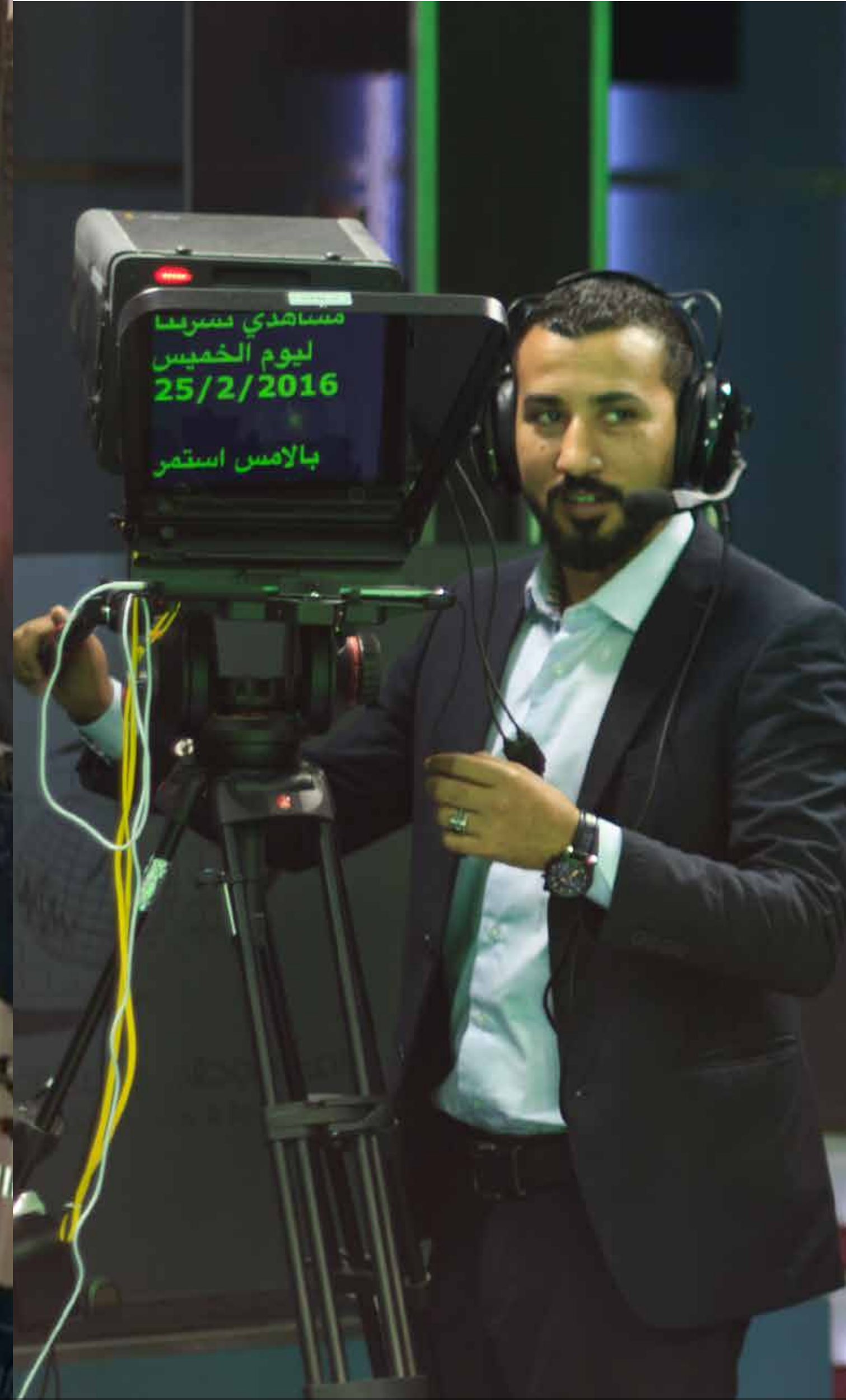
UAE WEATHER REPORT TV SHOW