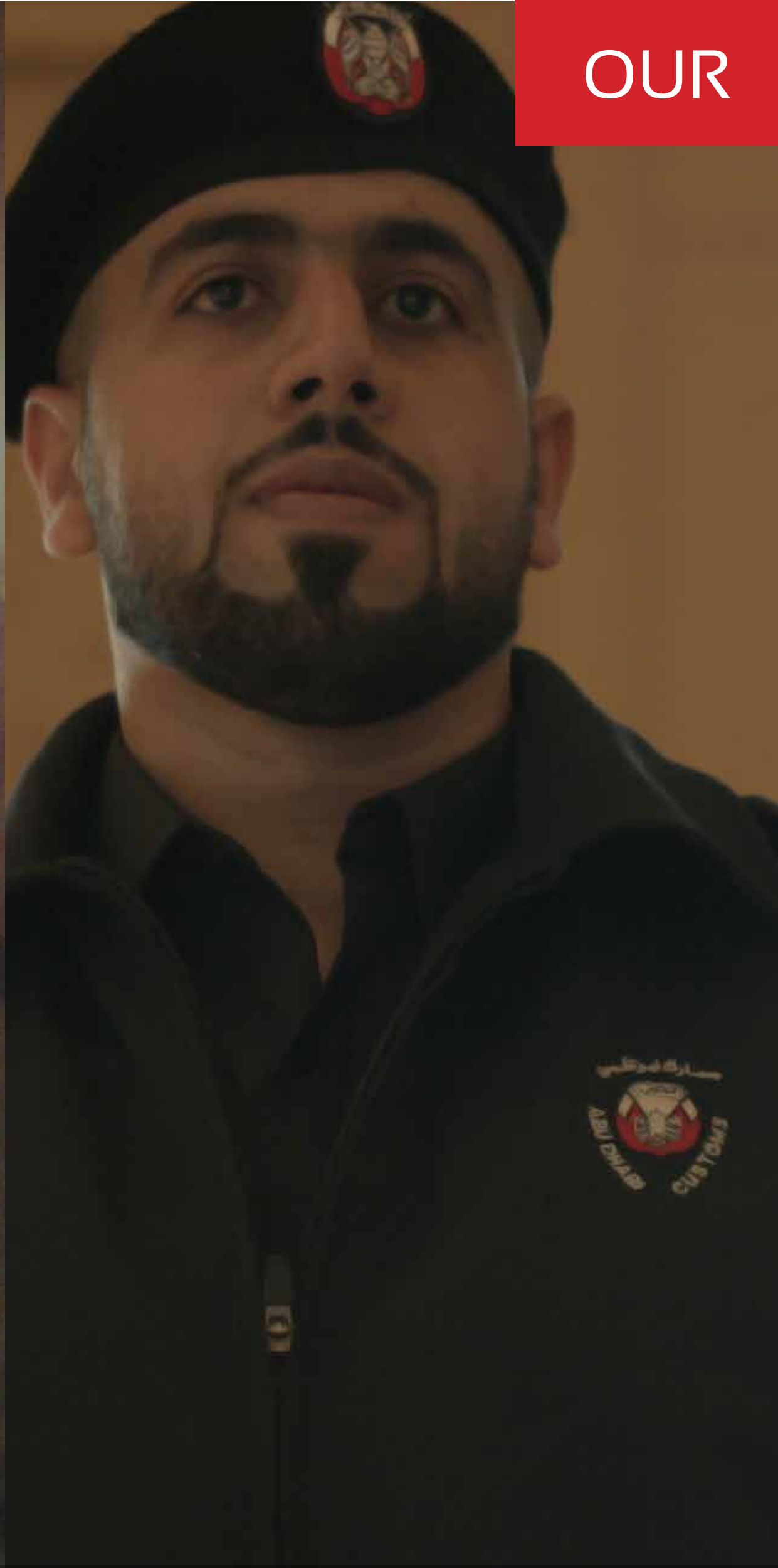
ABU DHABI CUSTOMS CORPORATE FILM