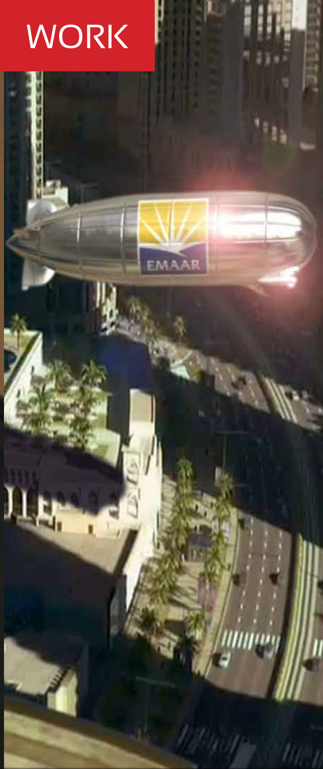
EMAAR CORPORATE FILM