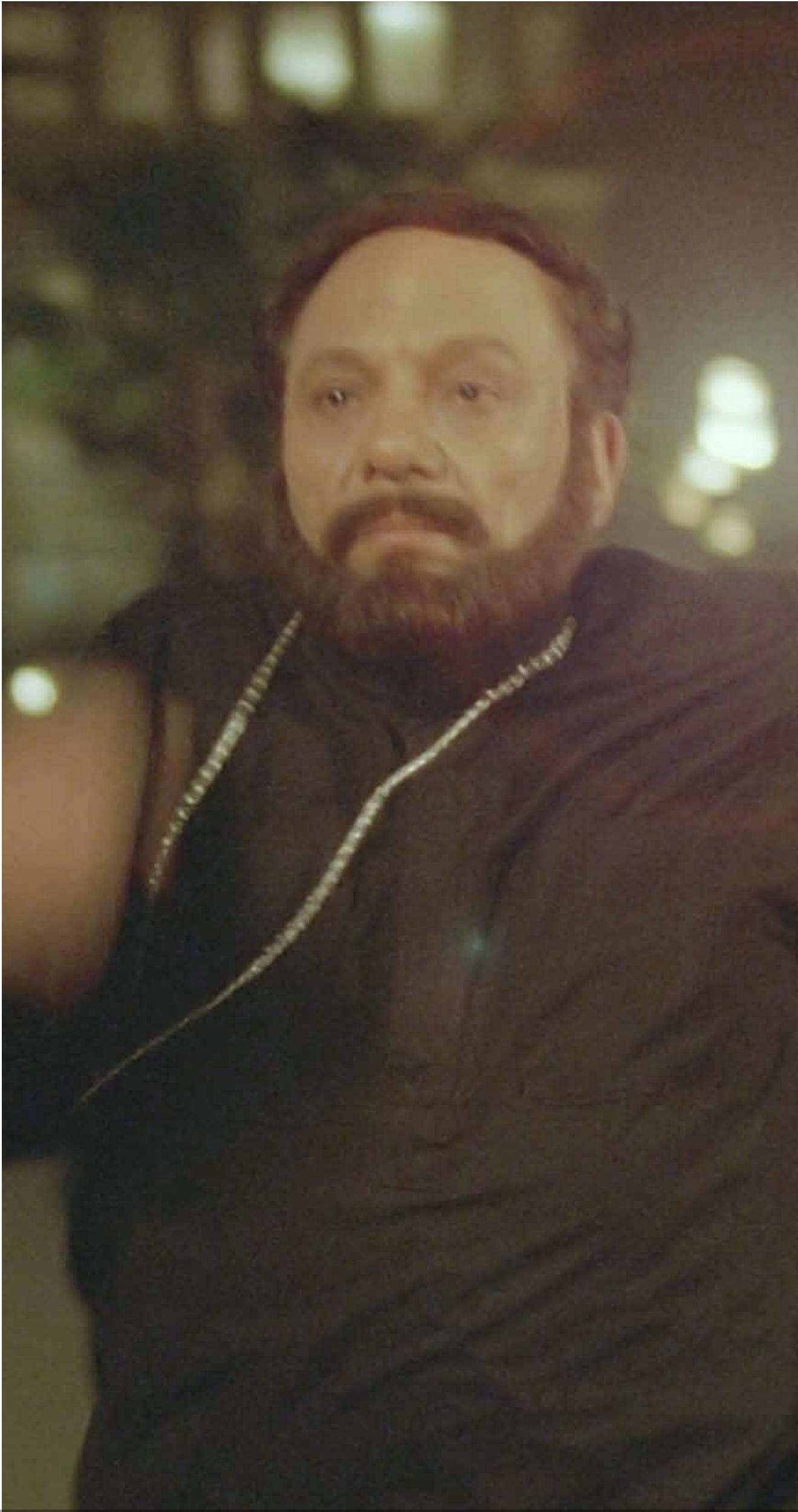
HASSAN WA MORCUS FEATURE FILM VFX